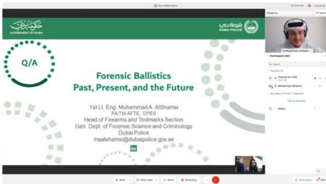
Pic: 1 Organizers welcoming the guest speaker

a) Screenshots of Webinar/ Picture of Event: Good quality picture with legends is mandatory